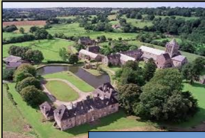
L'Abbaye de la Lucerne