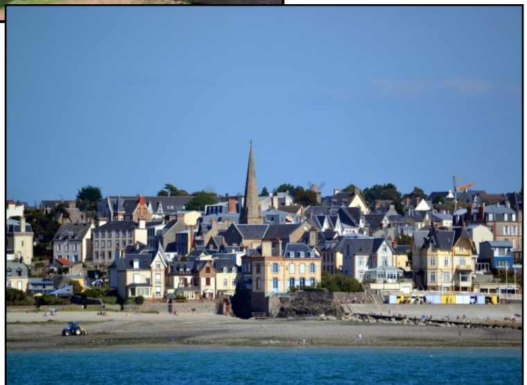
Saint Pair-sur- Mer