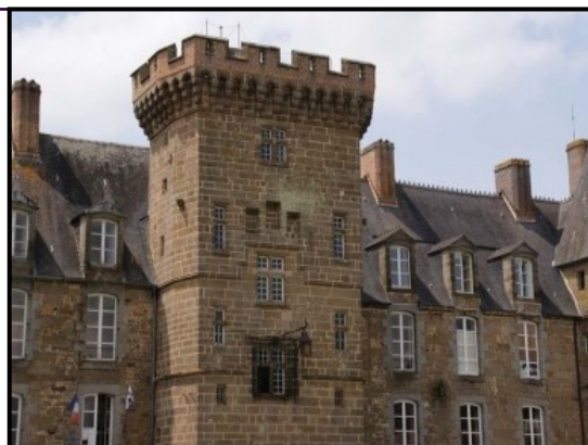
Chateau de Rânes,